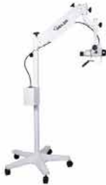
955 5-Step Colposcope