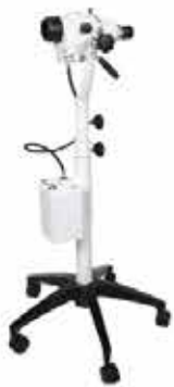
935 3-Step Colposcope