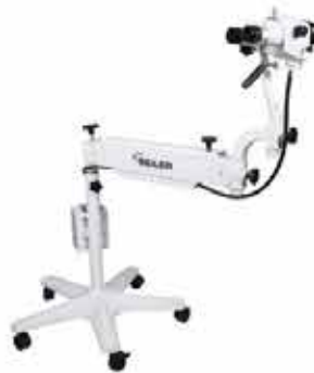
985 5-Step Colposcope