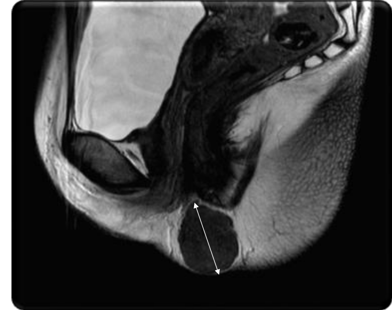
Figure 1 and 2 depict magnetic resonance imaging of the perineal mass.